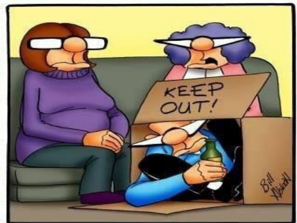
"I gave in and let him have a man cave."